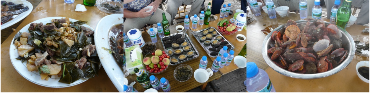
IMTA meal on board as the boat sails for hours in Sanggou Bay and the visitors wonder where and when the limits of the aquaculture operations will be reached. Left: kelp stew; middle: kelp snacks, abalones and sea cucumbers; right: scallops.

The authors also used a cost-benefit analysis (CBA), which is a widely accepted economic tool for rational and systematic decision-making. It may also be used to assess the environmental impacts of projects from an economic perspective, particularly those with a large number of environmental externalities and effects extending over a long period of time. The prices of kelps and scallops were 4 yuan/kg and 2.8 yuan/kg in 2009, respectively. The yield of kelp monoculture was 3750 Mt/km<sup>2</sup>, that of scallop monoculture was 4725 Mt/km<sup>2</sup> and that of IMTA was 7650 Mt/km<sup>2</sup>, including 3000 Mt/km<sup>2</sup> of kelps and 4650 Mt/km<sup>2</sup> of scallops. The cost of IMTA was higher than those of the monocultures; however, the percentages of salary and wages, energy and maintenance of IMTA were all lower than those of the monocultures, indicating that IMTA is more economical than the monocultures. IMTA exhibited the highest net present value (NPV), benefit to cost ratio (BCR) and relative coefficient (RC), followed by the kelp monoculture and scallop monoculture, further demonstrating that IMTA is the optimal model with both economic and environmental benefits. RC is a new index developed by the authors to balance the benefits and the efficiency of culture models.