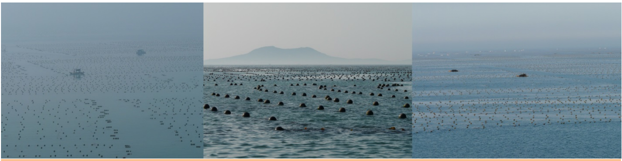
The level of the vastly large scale of aquaculture development in Sanggou Bay is what is always striking to a visitor discovering the region for the first time.

As an approach designed to mitigate the ecological effects of monoculture, integrated multitrophic aquaculture (IMTA) is attracting increased interest among researchers and commercial growers worldwide. However, sufficient quantitative assessment of IMTA is still lacking for decision makers, ecosystem managers and farmers to opt for the development of IMTA in openwater systems. In this study, the authors investigated three types of culture models in Sanggou Bay: the monoculture of kelps ( Saccharina japonica ), the monoculture of scallops ( Chlamys farreri ), and the IMTA of kelps and scallops, in order to compare the ecological and economic benefits between monocultures and IMTA.