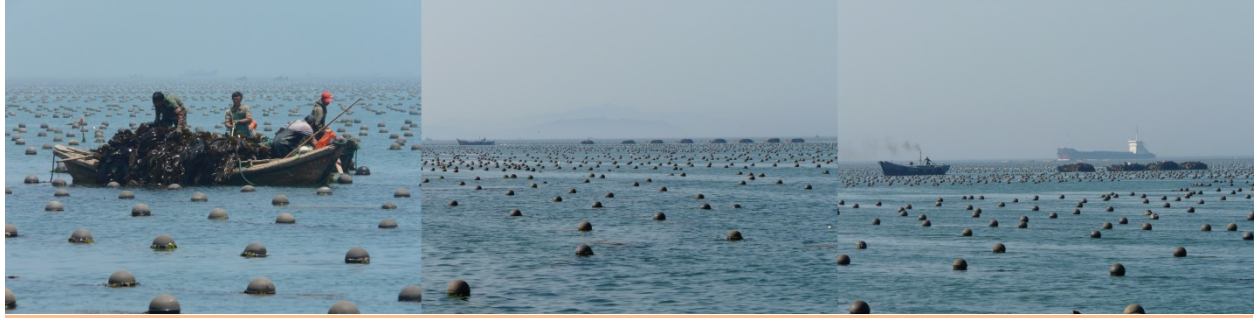
Left: harvesting of the kelp, Saccharina japonica , in Sanggou Bay; middle: a group of skiffs, loaded with kelps, is towed back to the processing plant; right: marine spatial planning at work with massive aquaculture fields and channels for the navigation of large commercial vessels (photo credits: Thierry Chopin).

The authors also used a cost-benefit analysis (CBA), which is a widely accepted economic tool for rational and systematic decision-making. It may also be used to assess the environmental impacts of projects from an economic perspective, particularly those with a large number of environmental externalities and effects extending over a long period of time. The prices of kelps and scallops were 4 yuan/kg and 2.8 yuan/kg in 2009, respectively. The yield of kelp monoculture was 3750 Mt/km<sup>2</sup>, that of scallop monoculture was 4725 Mt/km<sup>2</sup> and that of IMTA was 7650 Mt/km<sup>2</sup>, including 3000 Mt/km<sup>2</sup> of kelps and 4650 Mt/km<sup>2</sup> of scallops. The cost of IMTA was higher than those of the monocultures; however, the percentages of salary and wages, energy and maintenance of IMTA were all lower than those of the monocultures, indicating that IMTA is more economical than the monocultures. IMTA exhibited the highest net present value (NPV), benefit to cost ratio (BCR) and relative coefficient (RC), followed by the kelp monoculture and scallop monoculture, further demonstrating that IMTA is the optimal model with both economic and environmental benefits. RC is a new index developed by the authors to balance the benefits and the efficiency of culture models.