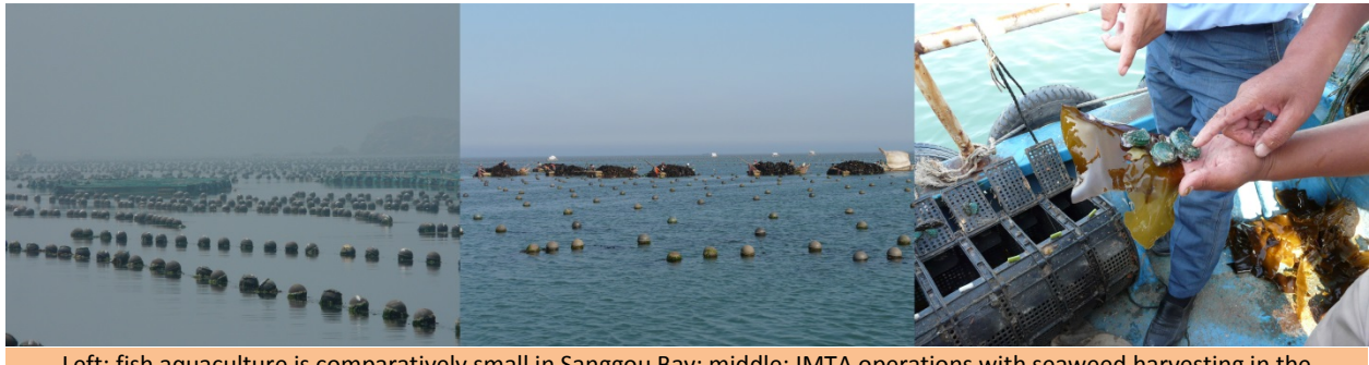
Left: fish aquaculture is comparatively small in Sanggou Bay; middle: IMTA operations with seaweed harvesting in the foreground and skiffs with white sun protective cloth for invertebrate farmers in the background; right: abalone and sea cucumbers, fed with fragments of kelp blades, are cultivated in these black containers suspended between the kelp lines (photo credits: Thierry Chopin).

The authors developed an effective method to ensure the validity of the assessment of IMTA's ecological and economic benefits, the emergy analysis, which evaluates the values of nature and human economy according to the thermodynamics principles, system theory and system ecology. The nutrient removal of kelp monoculture, scallop monoculture, and kelps/scallops IMTA was 193, 49, and 202 Mt nitrogen/km<sup>2</sup>, respectively. This indicates that IMTA was better for the environment than the other two models in terms of nutrient removal. IMTA also had the highest emdollar value, indicating that IMTA has the least negative impact on the environment among the three culture models. IMTA exhibited the highest environmental sustainability index (ESI), followed by kelp monoculture and scallop monoculture. This indicates that IMTA is more sustainable than the monocultures from both the economic and ecological aspects.